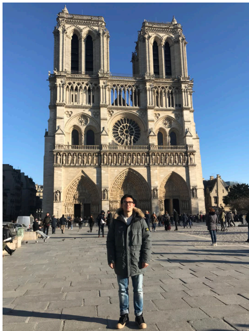
(notre dame de paris, March)

Travel in Europe: https://www.goeuro.com/travel/