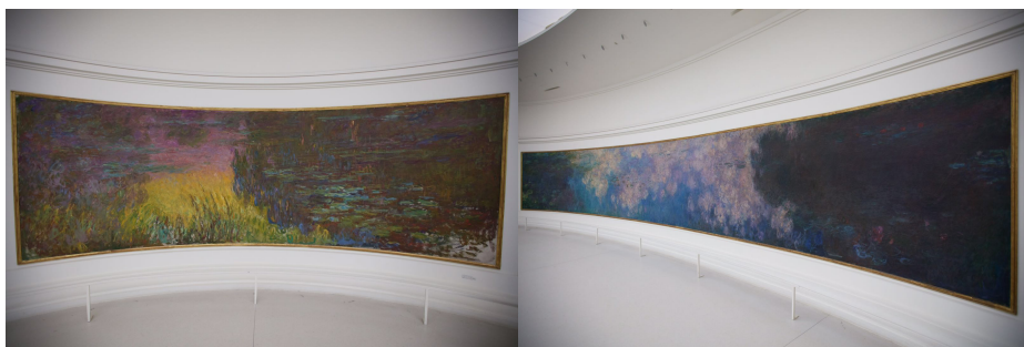
(Water Lilies, my favorite art series from Monet, from Musée de l'Orangerie)

My exchange journey finished in June 15 th . I finished all my exams in the beginning of month, and I spent the rest of my days traveling through the European continents. The weather was much better from February, I wish I could spent more time in Paris, to breath and embrace this beautiful city, with its long-standing history, magnificent art and architectures, and romanticism inside its culture.