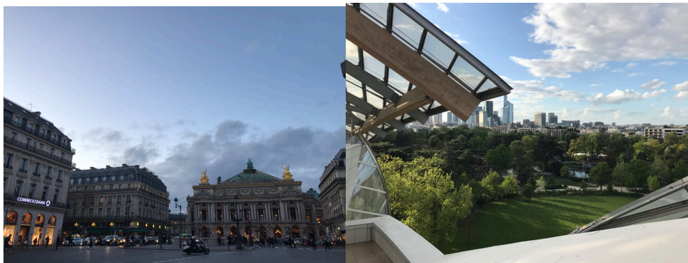
(Left: Opera Garnier, Paris) (Right: Paris from LVMH Foundation Museum)

I arrived Paris in the middle of February, it took my only few days to get familiar with the campus, which is in the northwest of the city center. The weather was quite windy and cold at that time. I went to Barcelona with some new friends I met in the school orientation before the semester started, the orientation only lasted for one day, so we had a lot of spare time to be familiar with the city and community.